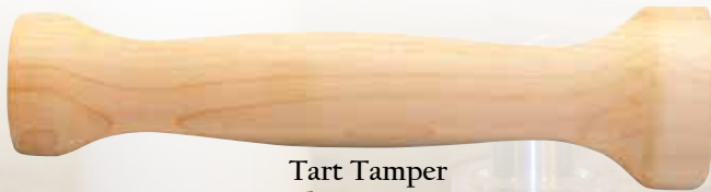
Tart Tamper Item code: TARTTAMP01