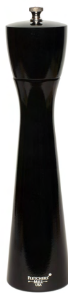
10" Black Item code: Pepper TRO10PM21 Salt TRO10SM21