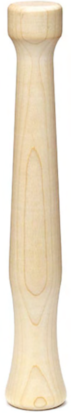
11" Muddler Item code: MUDDLER1