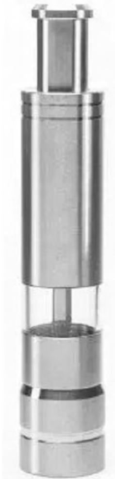
Salt or Pepper Pump & Grind (Unfilled) Item Code: STS06PG01

Some food preparation tasks make it difficult to have both hands free for grinding. That's why Fletcher's Mill offers the convenient Pump & Grind mills. With its sleek, stainless steel design and easy, one-handed operation, our original Pump & Grind mill delivers freshly ground pepper or salt with the press of a thumb. Perfect for restaurant waitstaff, by the campsite, out by the grill or on your stove top. Made in Taiwan.