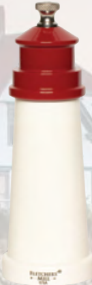
6" White with Red Top

Item Code: Pepper LIG06PM23 Salt LIG06SM23