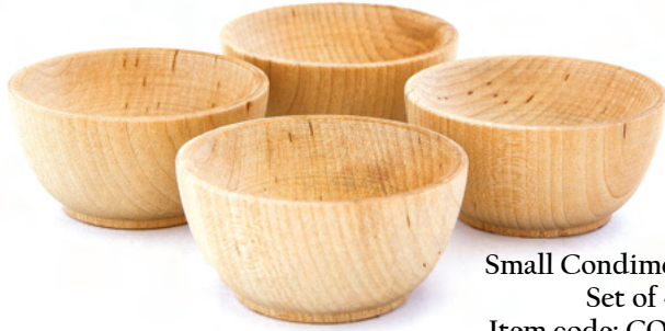
Small Condiment Cups: Set of 4 Item code: CONCUP01