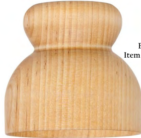
Biscuit Cutter Item code: BISCUIT01