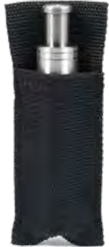
Belt Holster (P&G not included) Item code: HOLSTER1