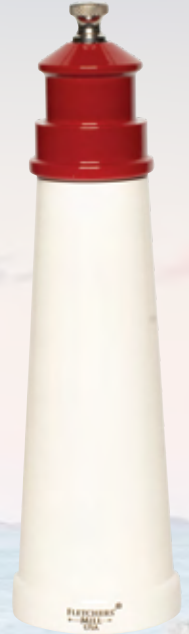
9" White with Red Top

Item Code: Pepper LIG09PM21 Salt LIG09SM21