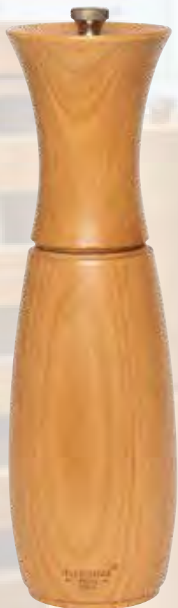
8" Cherry Item code: Pepper BGR08PM11 Salt BGR08SM11