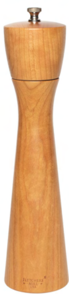
10" Cherry Item code: Pepper TRO10PM11 Salt TRO10SM11

The noble 10" Tronco style is available in pepper and salt mill styles.