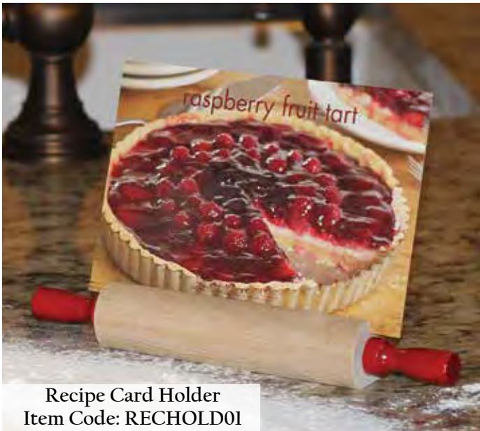
Recipe Card Holder Item Code: RECHOLD01