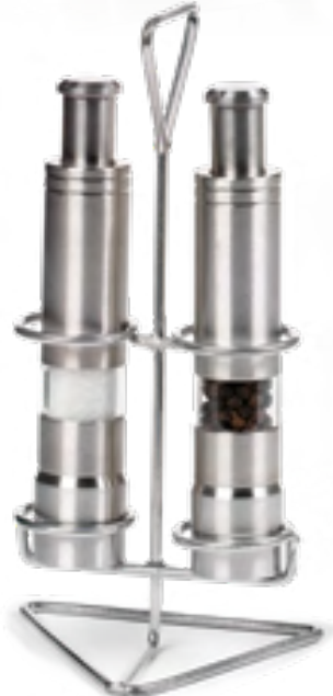
Tabletop Stand (P&G's not included) Item code: PGSTAND