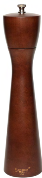
10" Walnut Stain Item code: Pepper TRO10PM12-14 Salt TRO10SM12-14