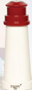
6" White with Red Shaker Top

Item Code: Pepper LIG06PM26 Salt LIG06SM26