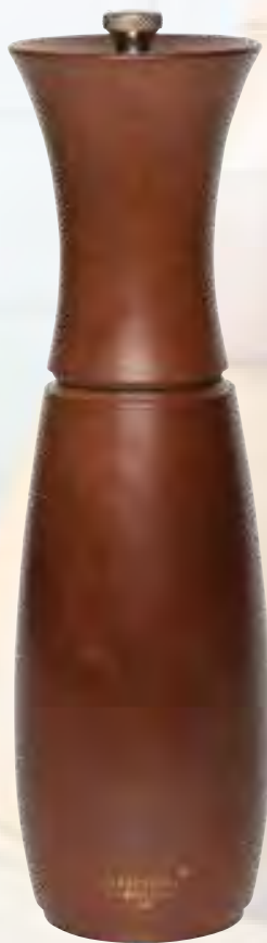
8" Walnut Stain Item code: Pepper BGR08PM12-14 Salt BGR08SM12-14