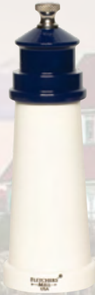
6" White with Cobalt Top

Available in 6" and 9" pepper and salt mills, and 6" salt shaker.