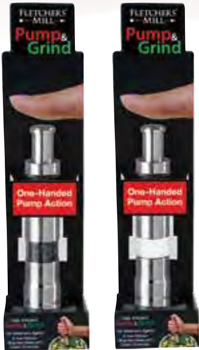
Black Retail Box Pump & Grind -Prefilled Item codes: Pepper - STS06PM01-BB Salt - STS06SM01-BB