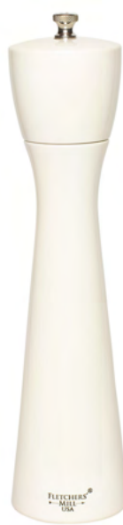
10" White Item code: Pepper TRO10PM24 Salt TRO10SM24