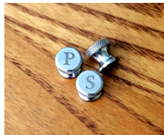
Fletchers' Mill locking crown nuts.