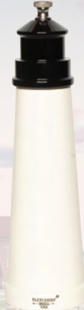
9" White with Black Top

Item Code: Pepper LIG09PM21 Salt LIG09SM21