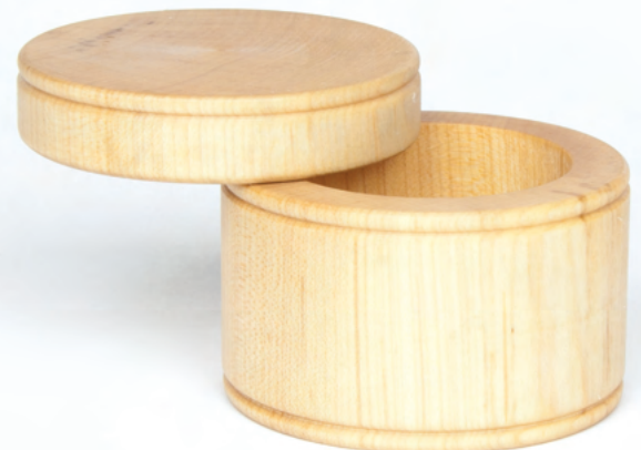
Salt Cellar Item code: SALTCELL01

*Made in Maine from solid, premium New England Hardwoods.