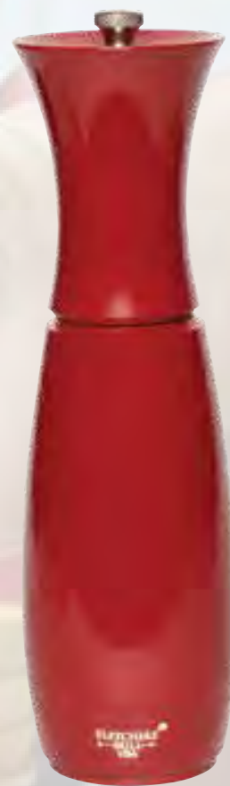
8" Cinnabar Item code: Pepper BGR08PM22 Salt BGR08SM22