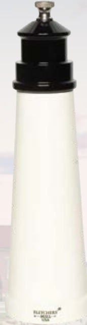
9" White with Black Top

Item Code: Pepper LIG09PM21 Salt LIG09SM21