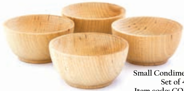
Small Condiment Cups: Set of 4 Item code: CONCUP01