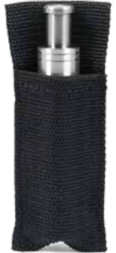
Belt Holster (P&G not included) Item code: HOLSTER1