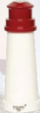
6" White with Red Shaker Top

Item Code: Pepper LIG06PM26 Salt LIG06SM26