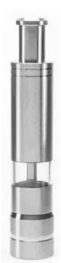
Salt or Pepper Pump & Grind (Unfilled) Item Code: STS06PG01

Some food preparation tasks make it difficult to have both hands free for grinding. That's why Fletcher's Mill offers the convenient Pump & Grind mills. With its sleek, stainless steel design and easy, one-handed operation, our original Pump & Grind mill delivers freshly ground pepper or salt with the press of a thumb. Perfect for restaurant waitstaff, by the campsite, out by the grill or on your stove top. Made in Taiwan.