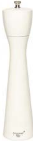
10" White Item code: Pepper TRO10PM24 Salt TRO10SM24