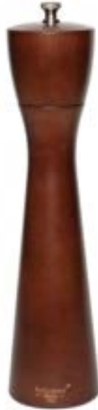
10" Walnut Stain Item code: Pepper TRO10PM12-14 Salt TRO10SM12-14