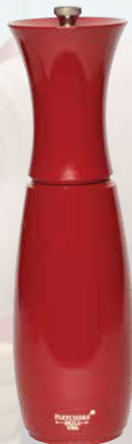
8" Cinnabar Item code: Pepper BGR08PM22 Salt BGR08SM22