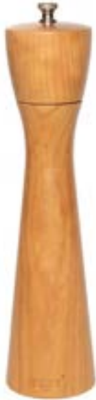
10" Cherry Item code: Pepper TRO10PM11 Salt TRO10SM11

The noble 10" Tronco style is available in pepper and salt mill styles.