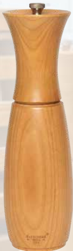
8" Cherry Item code: Pepper BGR08PM11 Salt BGR08SM11