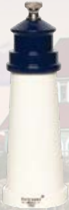
6" White with Cobalt Top

Available in 6" and 9" pepper and salt mills, and 6" salt shaker.