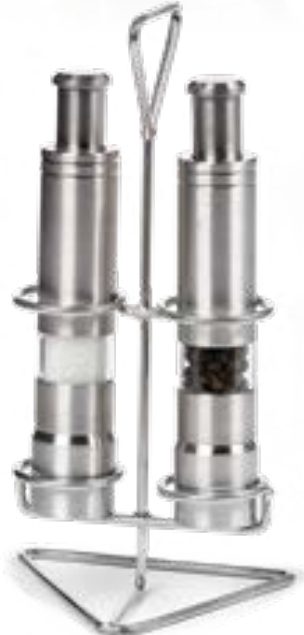
Tabletop Stand (P&G's not included) Item code: PGSTAND