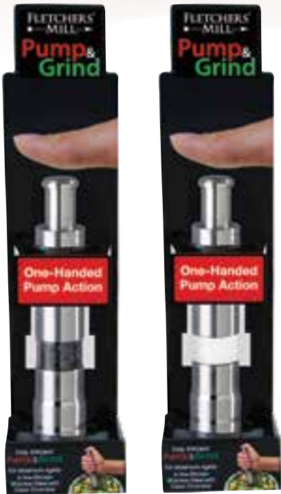
Black Retail Box Pump & Grind -Prefilled Item codes: Pepper - STS06PM01-BB Salt - STS06SM01-BB