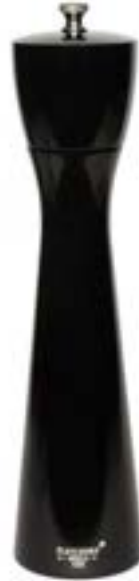
10" Black Item code: Pepper TRO10PM21 Salt TRO10SM21