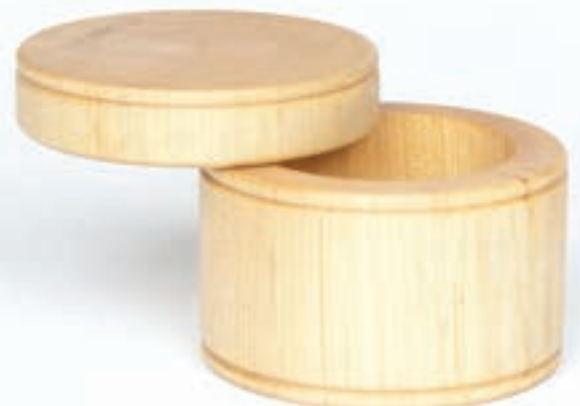
Salt Cellar Item code: SALTCELL01

*Made in Maine from solid, premium New England Hardwoods.