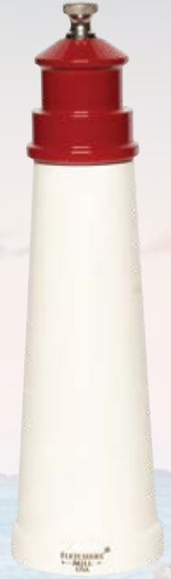
9" White with Red Top

Item Code: Pepper LIG09PM21 Salt LIG09SM21