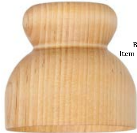
Biscuit Cutter Item code: BISCUIT01