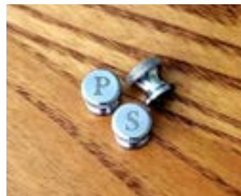
Fletcher's Mill locking crown nuts.