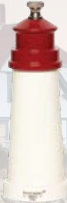
6" White with Red Top

Item Code: Pepper LIG06PM23 Salt LIG06SM23