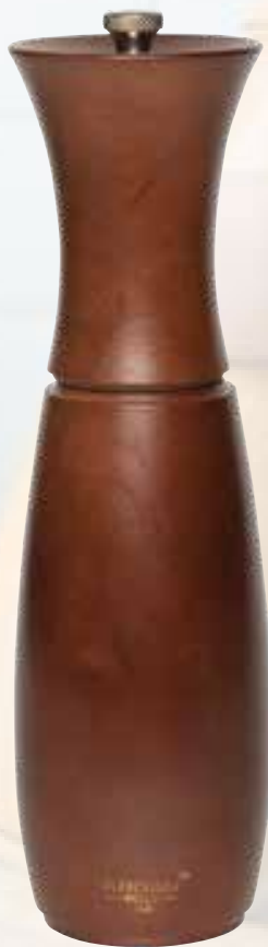
8" Walnut Stain Item code: Pepper BGR08PM12-14 Salt BGR08SM12-14