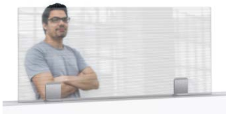
Avant Garde™ 48" Polycarbonate Tabletop Divider 48 x 3 x 20 in Item #TD010 Includes Stainless Steel Brackets