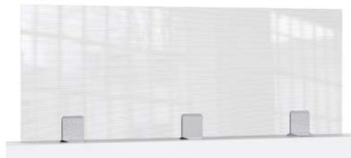
Avant Garde™ 60" Polycarbonate Tabletop Divider 60 x 3 x 20 in Item #TD011 Includes Stainless Steel Brackets