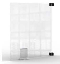
Avant Garde™ 24" Polycarbonate Tabletop Divider 24 x 3 x 20 in Item #TD013 Includes Stainless Steel Brackets and Cross Connectors