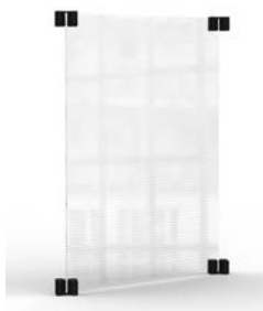
Avant Garde™ 18" Polycarbonate Tabletop Divider 18x 0.16 x 20 in Item #TD014 Includes Cross Connectors