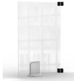
Avant Garde™ 18" Polycarbonate Tabletop Divider 18 x 3 x 20 in Item #TD012 Includes Stainless Steel Brackets and Cross Connectors