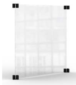
Avant Garde™ 24" Polycarbonate Tabletop Divider 24 x 0.16 x 20 in Item #TD015 Includes Cross Connectors