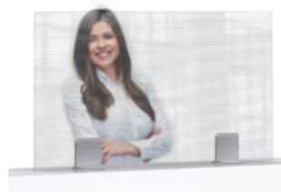
Avant Garde™ 36" Polycarbonate Tabletop Divider 36 x 3 x 20 in Item #TD008 Includes Stainless Steel Brackets